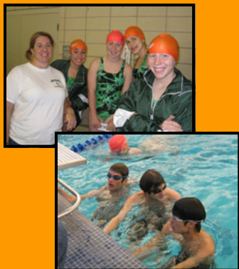
State Swim Meet

The Louisiana State Department of Education's High School Redesign Staff has begun publishing a monthly newsletter, High Value High Schools for Louisiana. BFHS was highlighted in the first edition of the new publication. You may view the full article on the BFHS website News page.